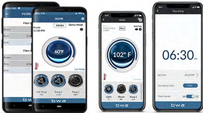
bwa™ for Android™