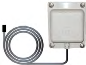
Balboa Wi-Fi Module

This is an optional feature. The Spa can be controlled by using the Balboa Worldwide App (bwa™) that allows you to access your spa via a direct connection anywhere in the local proximity of your tub, anywhere in your house that you can connect to your local Wi-Fi network, or anywhere in the World you have an Internet connection to your smart device via 3G, 4G, or Wi-Fi. The bwa™ app can be downloaded from Google play store or Apple App store. Follow instructions on the app to complete the setup and connect to the Purfikt spa.